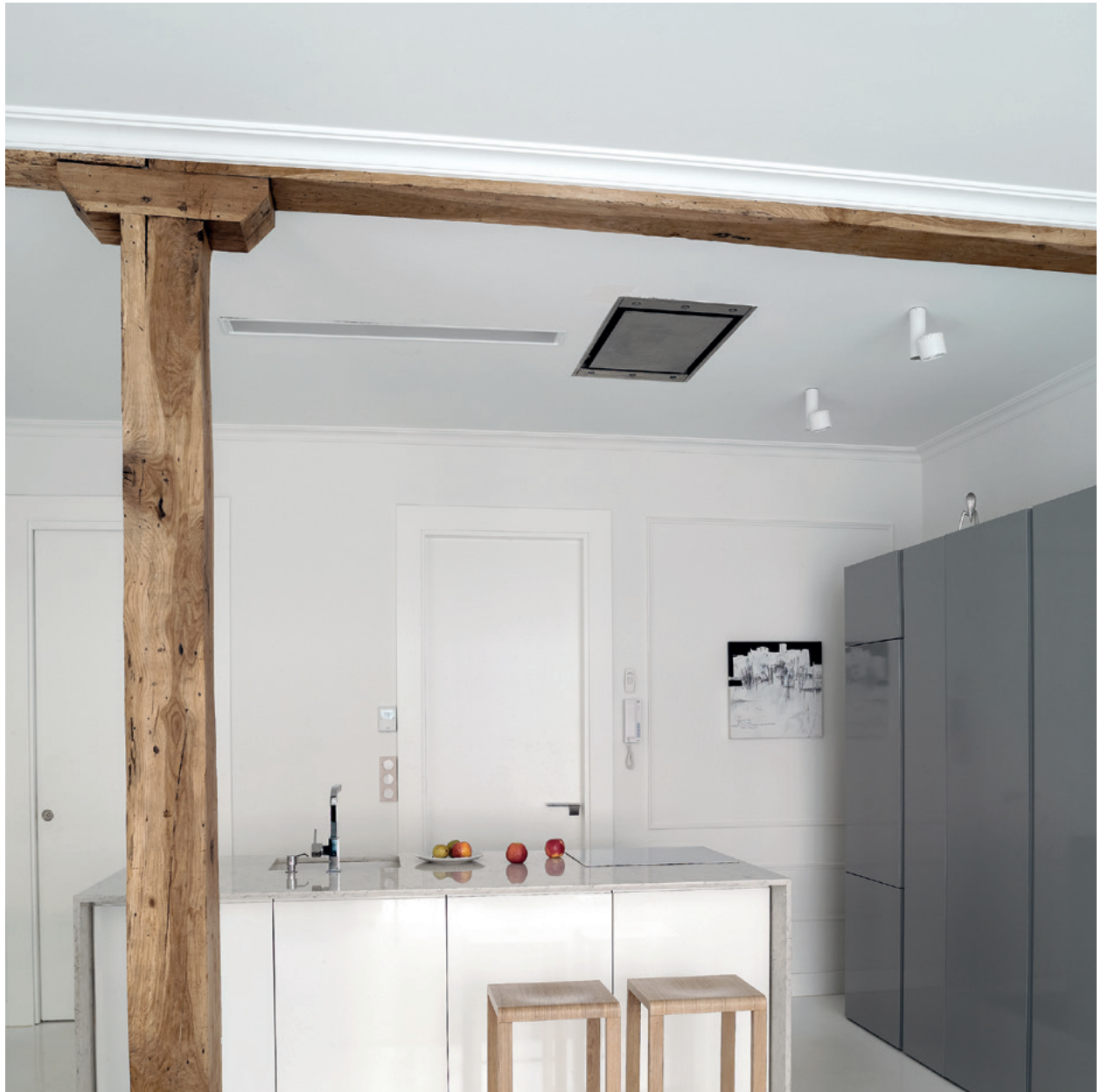
Private residence, San Sebastián (Spain) | Design: Ziako Interiorismo