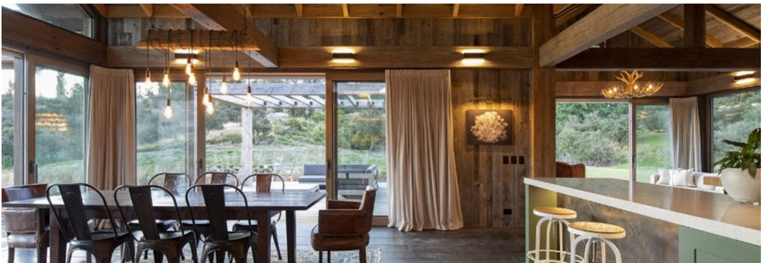
QUEENSTOWN CHATEAU, QUEENSTOWN