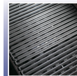
Heavy Duty Cast Iron Cooking Grids