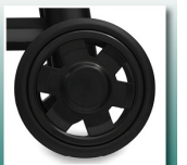
Large Crack-Proof Wheels