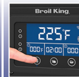
Digital Control Display with Smart-Touch System