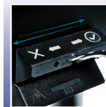
Burn Pot Agitator