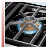
Commercial Grade Side Burner