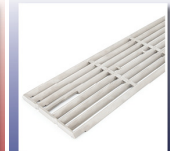
Heavy Duty Cast Stainless Steel Cooking Grids