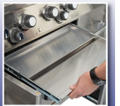
Slide-Out Grease Tray System