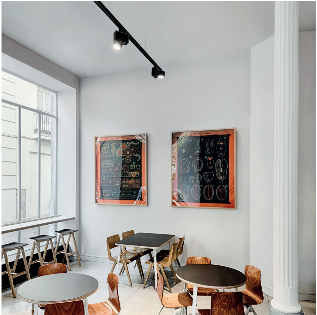
Federal Café, Valencia (Spain) | Design: Hadit Arquitectos