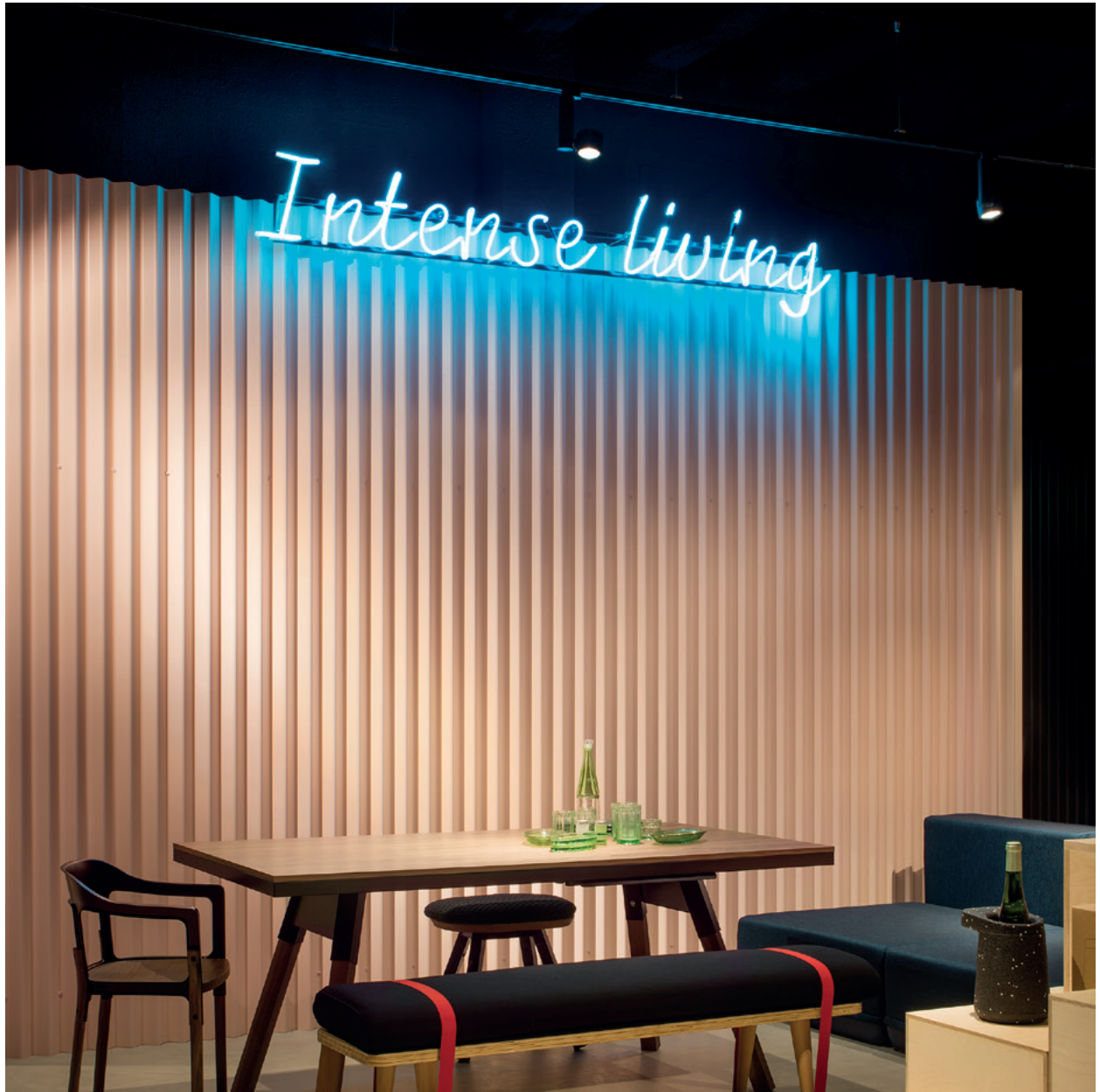
RS - Barcelona Showroom