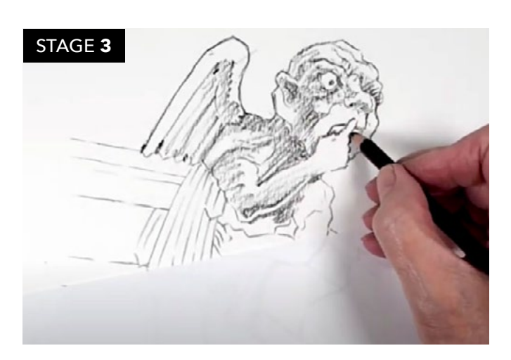
Now let's build up the density across the whole drawing with the same medium charcoal pencil.