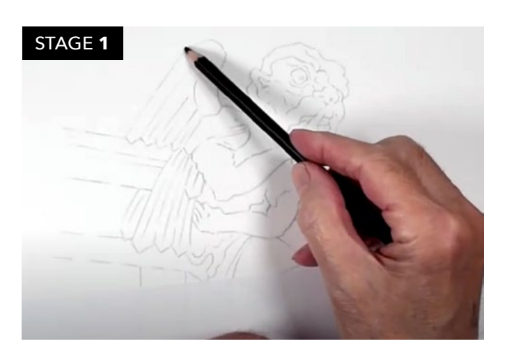
Begin your drawing by outlining your subject in hard charcoal pencil on to smooth paper...