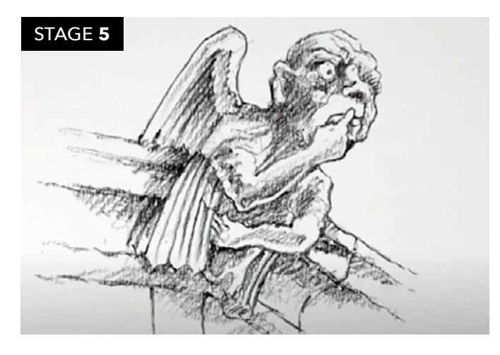
A few final details and touches and your gargoyle is complete.

Share your version of the medium charcoal Gargoyle drawing on Facebook or Instagram #castlearts