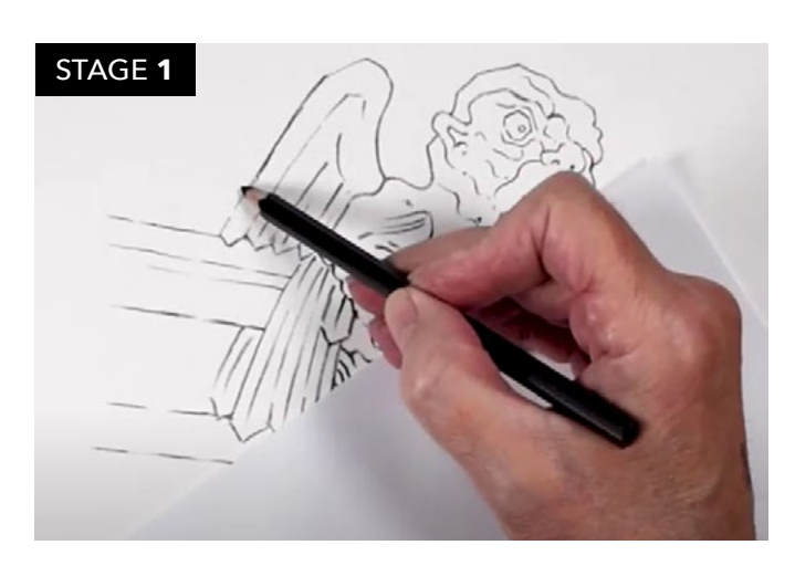
Begin your drawing by outlining your subject in soft charcoal pencil on to smooth paper...