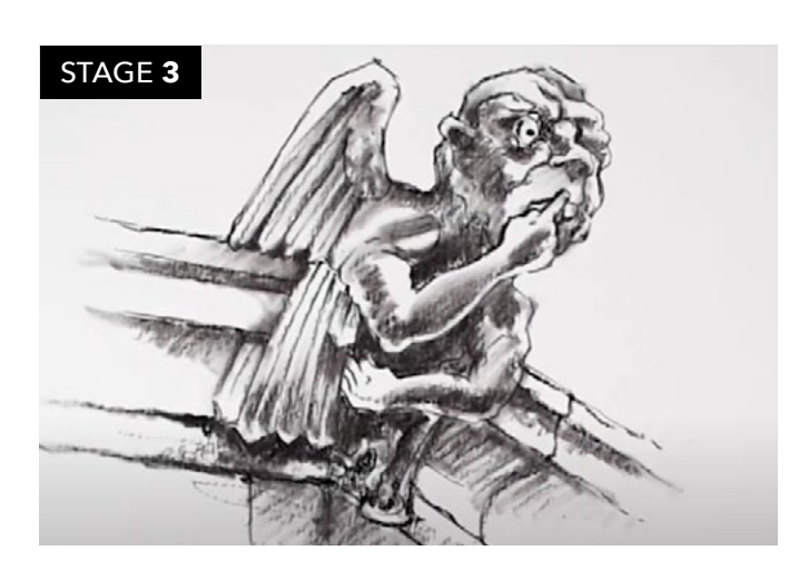
Now let's build up the density across the whole drawing with the same soft charcoal pencil.