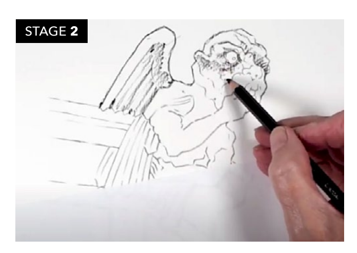
Lightly shade and hatch the entire drawing, strengthening the linework as you go.