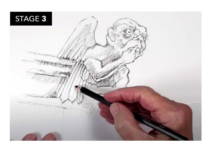
Now let's build up the density across the whole drawing with the same hard charcoal pencil.