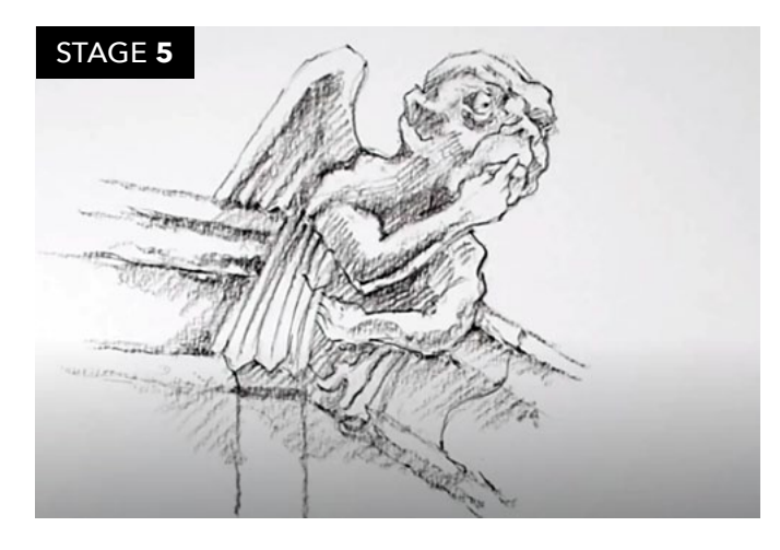
A few final details and touches and your gargoyle is complete.

Share your version of the hard charcoal Gargoyle drawing on Facebook or Instagram #castlearts