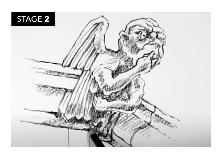
Lightly shade and hatch the entire drawing, strengthening the linework as you go.