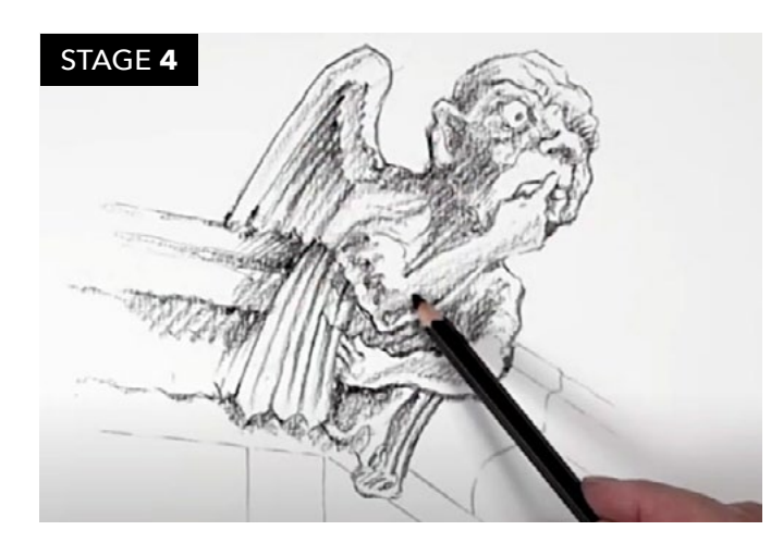
Keep the dark tones coming for added contrast and definition.