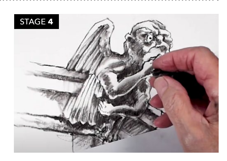
Keep the dark tones coming for added contrast and definition.