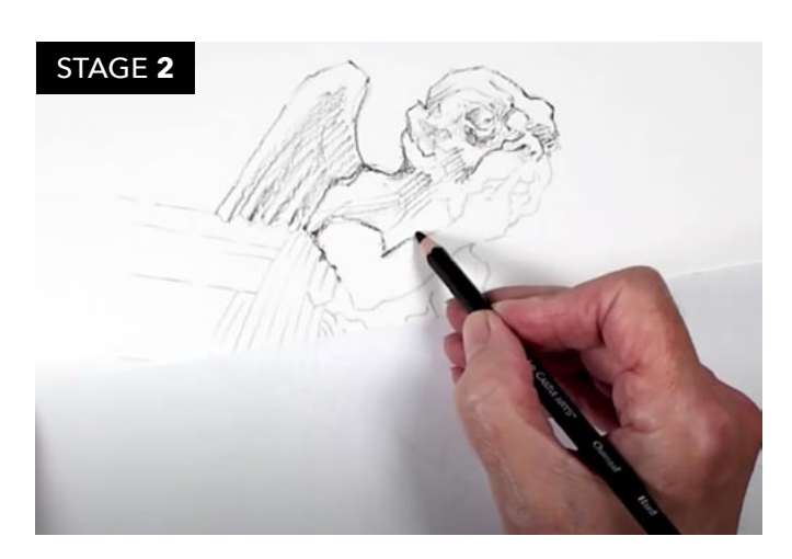
Lightly shade and hatch the entire drawing, strengthening the linework as you go.