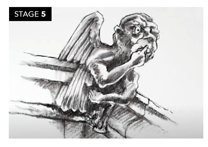
A few final details and touches and your gargoyle is complete.

Share your version of the soft charcoal Gargoyle drawing on Facebook or Instagram #castlearts