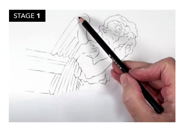
Begin your drawing by outlining your subject in medium charcoal pencil on to smooth paper...