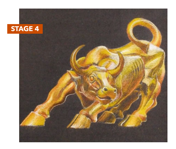
Now more golden tones are achieved by introducing some brown shading and some subtle blending to enrich the colours.