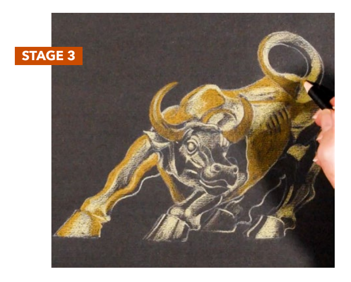
Keep on intensifying the drawing by gradually adding further layers of golden colour and tone.