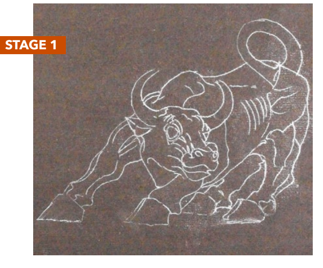
To begin our illustration we need to trace the image down in white pencil onto a dark paper.