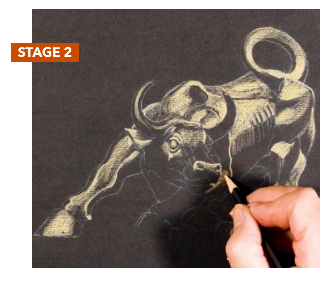
Next add an initial base of pale yellow, noting the tonal values as you go. Even at this early stage we see the ox taking shape.

castlearts.co.uk castlearts.com #castlearts