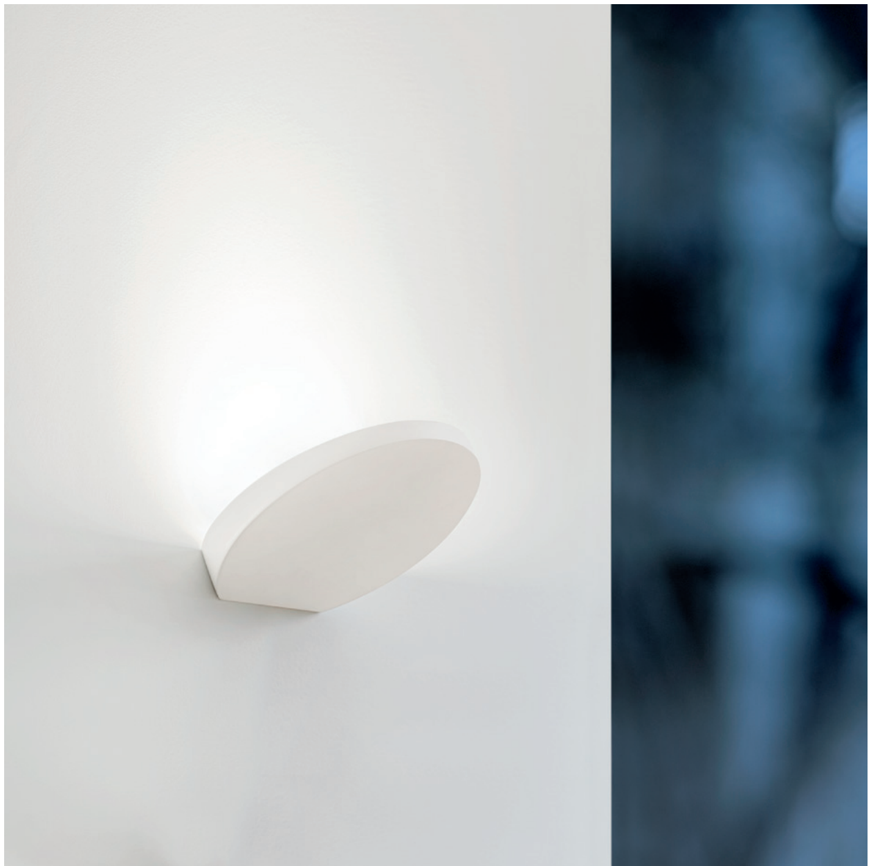
Bulthaup Showroom, Valencia (Spain) | Design: Alfredo Monzó