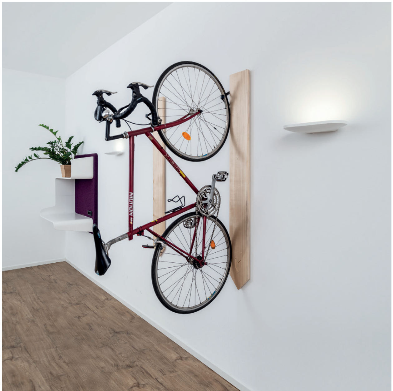
Innovex GmbH, Hamburg (Germany) | Design: Christin Kaldma