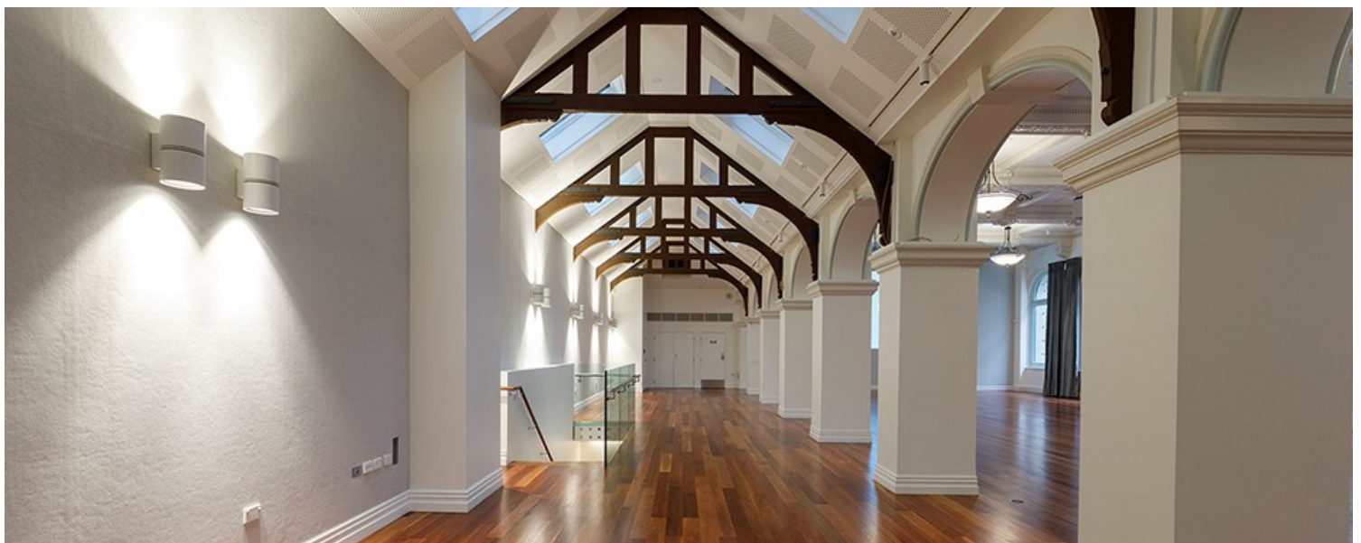
PUBLIC TRUST, WELLINGTON