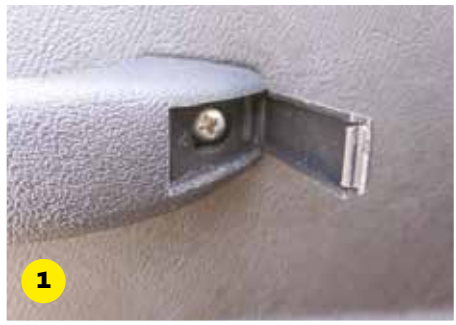
Pull back flaps on door handle