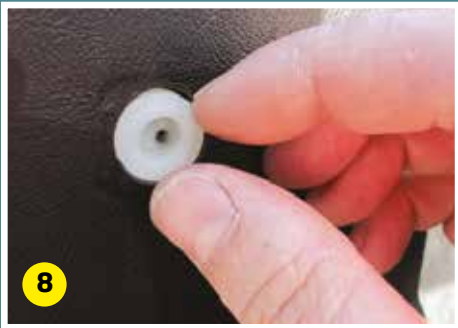
Insert spacer into fastener holes in the door panel