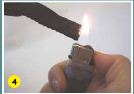
Seal nylon webbing end by warming with a lighter