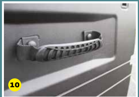
Position handle to suit your preference. Tighten fixing screws. Fit screw caps.