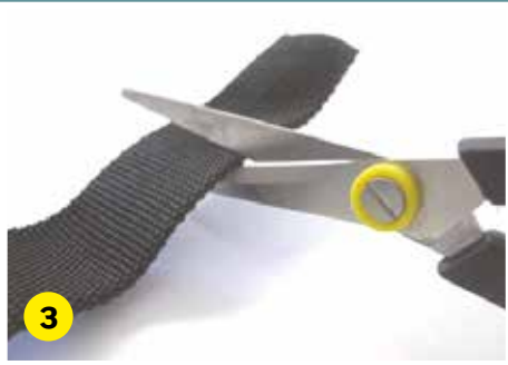
Cut the webbing strap to your preferred length. This is optional.