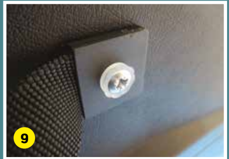
Screw the fixings into place