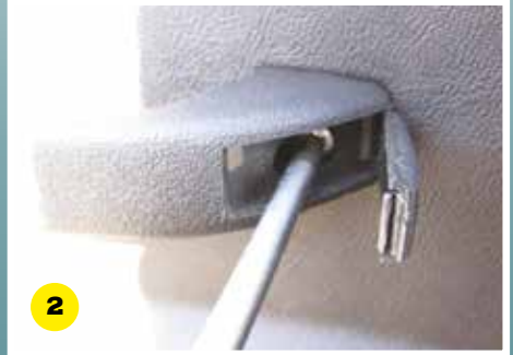
Remove handle with Philips screwdriver. Retain the two handle screws