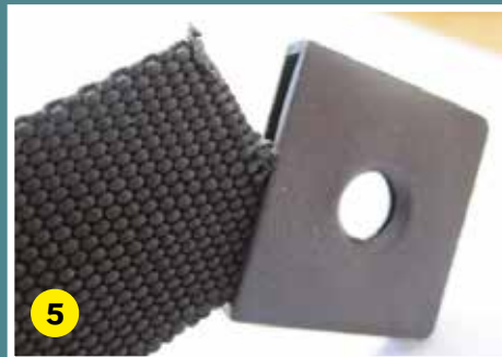
Insert webbing strap into the end cap