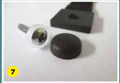
Insert fixing screws into the hinged screw caps