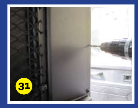
Fix into place using the smaller screw/rivet fasteners. These fasteners can also be tapped into place with a hammer.

Drill the front fasteners in place into the B pillar on the hardtop using a 6mm drill bit.