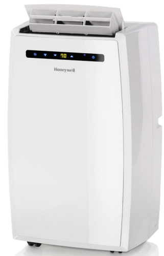
Product Dimensions (in): 18.1 (W) 15.2 (D) 29.3 (H) Net Weight: 62.8 lbs

4-in-1 All-season appliance, this Portable AC with Heat Pump, Fan & Dehumidifier cools or heats a room up to 350-450 Sq. Ft. Automatic vertical wind motion helps distribute powerful cool/warm air evenly for fast & consistent cooling/heating.