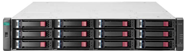
HPE MSA 2042 Storage (LFF)

The MSA 2042 further drives the MSA 2040 family into the world of flash acceleration with a new set of MSA models which includes 800GB of flash capacity in all SFF and LFF configurations. In addition to including 2x400GB Mixed Use SSDs in the base configuration, the MSA 2042 also includes a rich set of software features as standard including 512 Snapshots, Remote Replication and Performance Tiering capabilities, all at a very attractive price compared to other hybrid configurations. The 800GB of SSD capacity can be used as Read Cache or as a start to building a fully tiered configuration. With the inclusion of the Advanced Data Services SW License, customers can choose how to best utilize these SSDs to provide the optimal flash acceleration for their performance hungry applications. Both Read Cache and Performance Tiering utilize a real-time tiering algorithm which works without user intervention to place the most accessed data on the fastest medium at the right time. The MSA 2042 will dynamically move hot pages up to SSD for flash acceleration and move cooler, more stagnant data back down to spinning media as workloads change in real time hour-to-hour, day-to-day, and week-to-week. All done hands free and without any management overhead from the IT manager.