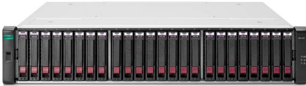
HPE MSA 2042 Storage (SFF)