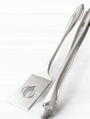
PRO STAINLESS STEEL 2 PIECE TOOLSET #70033