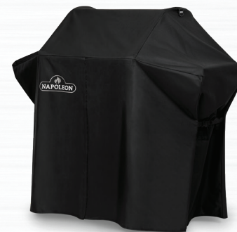
PREMIUM FITTED COVER #61527

This innovative and easy to use ignition system shoots a jet of flame to light each gas burner individually for quick start-ups