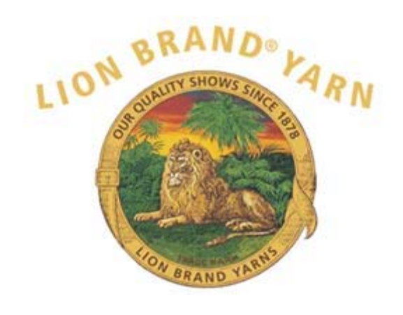
Free Knitting Pattern Lion Brand® Pound of Love Baby Love Romper and Hat Pattern Number: 60242