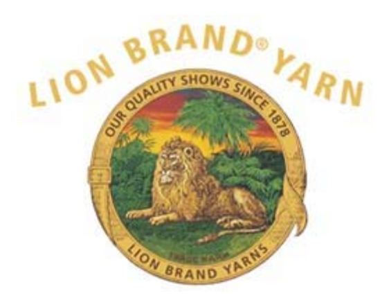
Free Crochet Pattern Lion Brand® Fun Fur Season's Best Stocking Pattern Number: 40408aAD