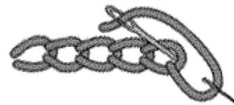
The Embroidery Chain Stitch

Embroidery Chain Stitch. Thread embroidery needle with embroidery thread and make a small knot at the end. With the right side of the towel facing up, bring the needle up from underneath the towel to the top; make a small loop and hold it in place against fabric with thumb. Bring needle back down to underside, in same space where it came up. *Bring needle up inside loop just made, toward the top, and make a new loop which will lay outside the stitch made, by bringing needle back down in space where it came up. Repeat from * for required number of chains. End by bringing needle up inside loop and then bringing it down outside the loop to anchor final stitch.