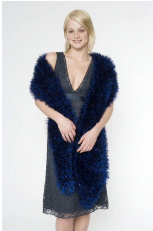
A Garter stitch wrap worked with 3 strands of yarn held together.