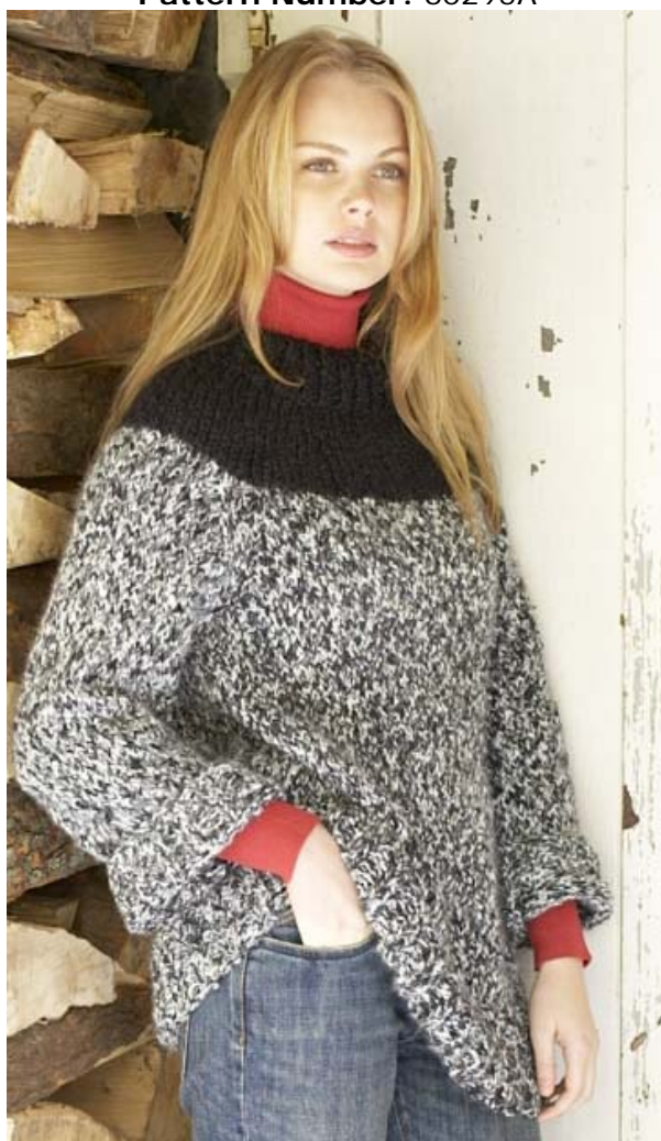
Comfortable chic in an easy-fitting pullover with updated styling.