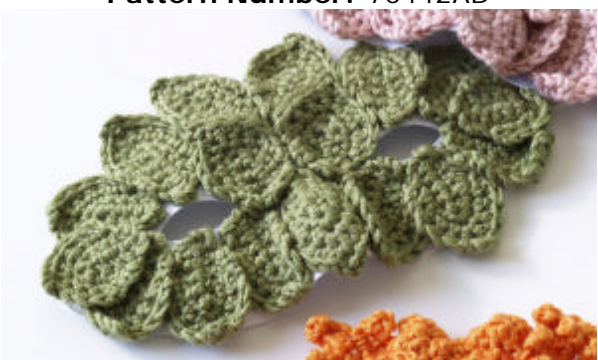
Fun for halloween or mardi gras!