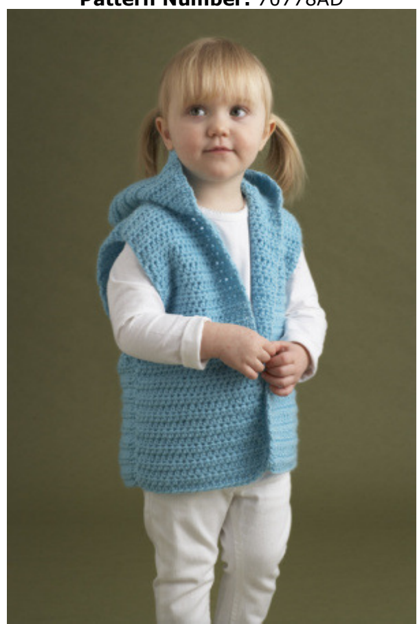
This is a great children's vest for the Fall and Winter.