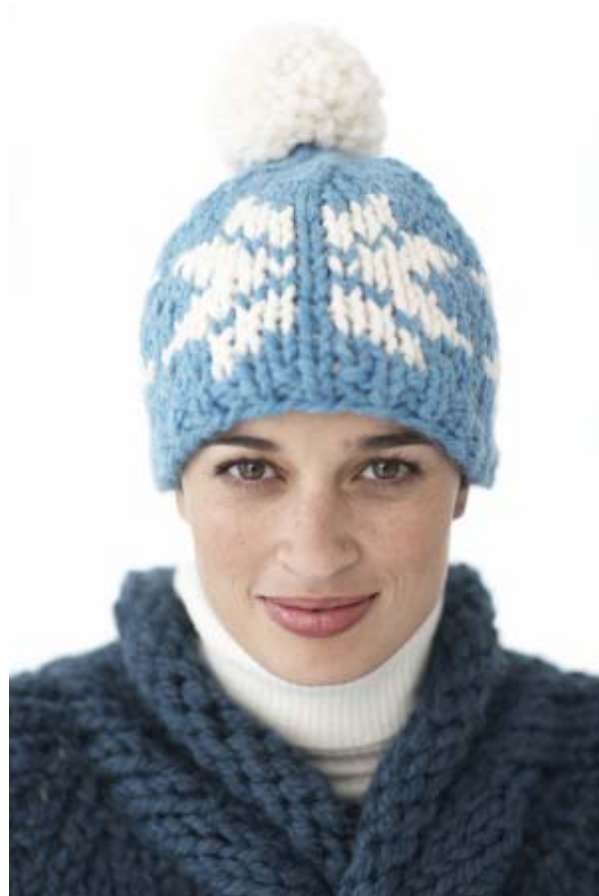
This warm fair isle hat is knit in the round.