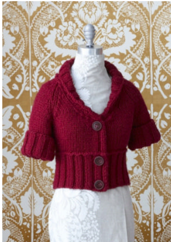
This cropped cardigan features a great shawl collar.