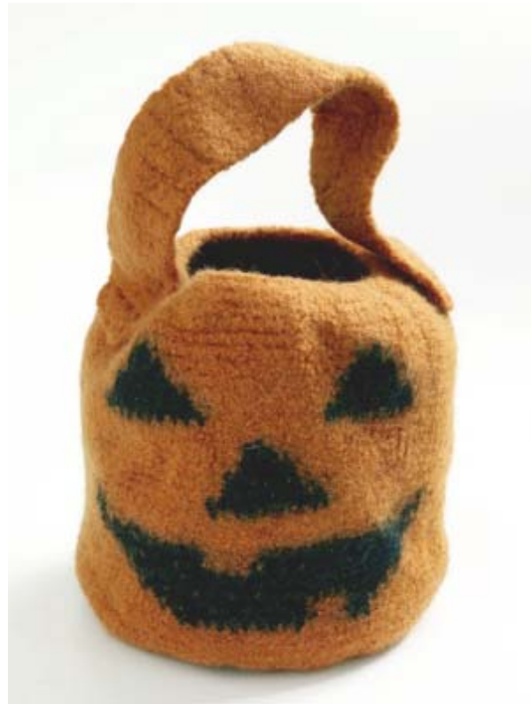
Jack-O-Lantern bag for Trick-or-Treating or a Halloween decoration.