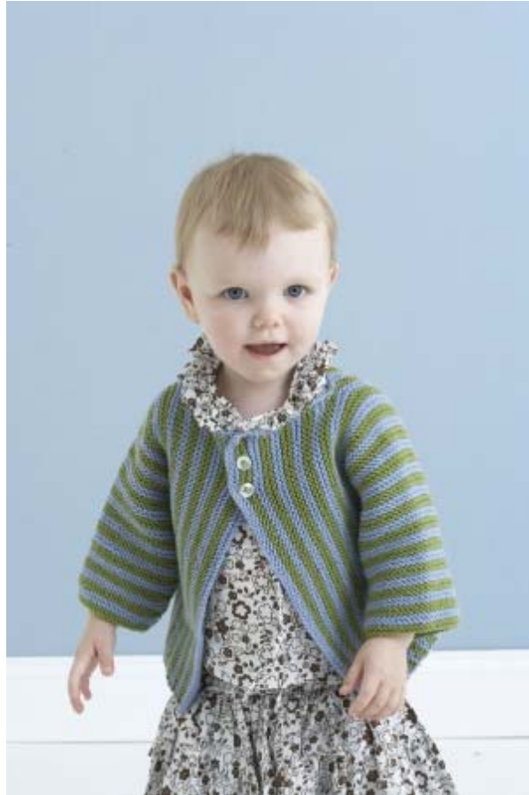
This beautiful baby cardigan is bright and fun.