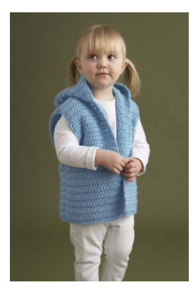
This is a great children's vest for the Fall and Winter.