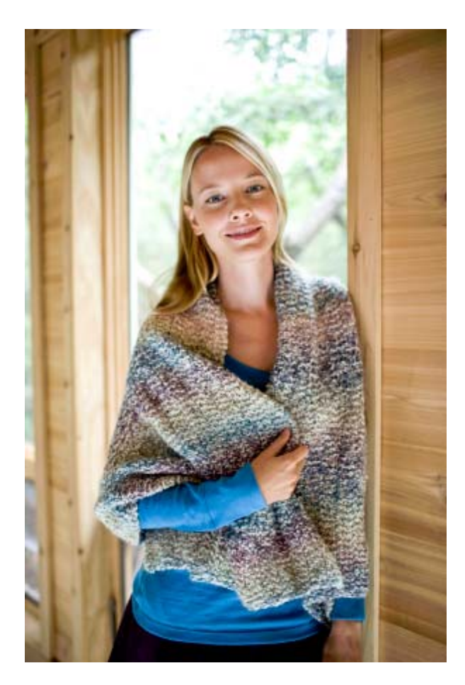
Give the gift of a beautiful hand-knit prayer shawl.