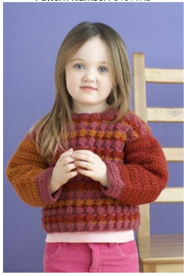
This classic pullover sweater is colorful and cozy.