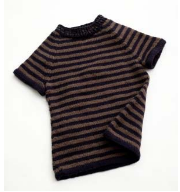
This striped raglan tee is cute and flattering.