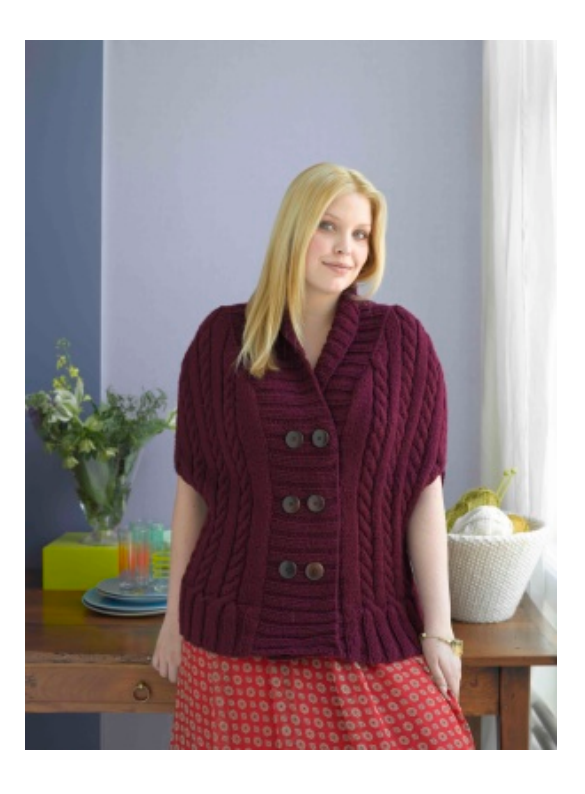
Sizes S-L, 1X-2X. This buttoned cape features a classic cabled design.