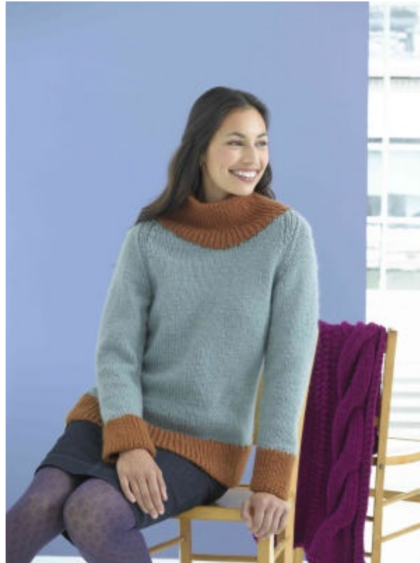
Sizes S, M-L, 1X-2X. This cozy two-toned pullover is great for cool fall and winter weather.