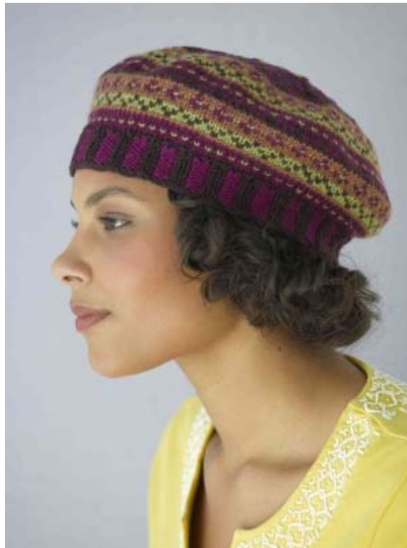
This fair isle hat is decorative and colorful.