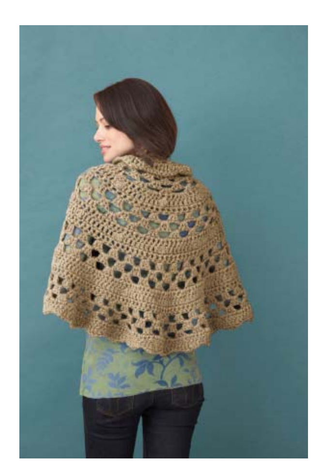
This lacy half-moon shawl is great for any occasion.