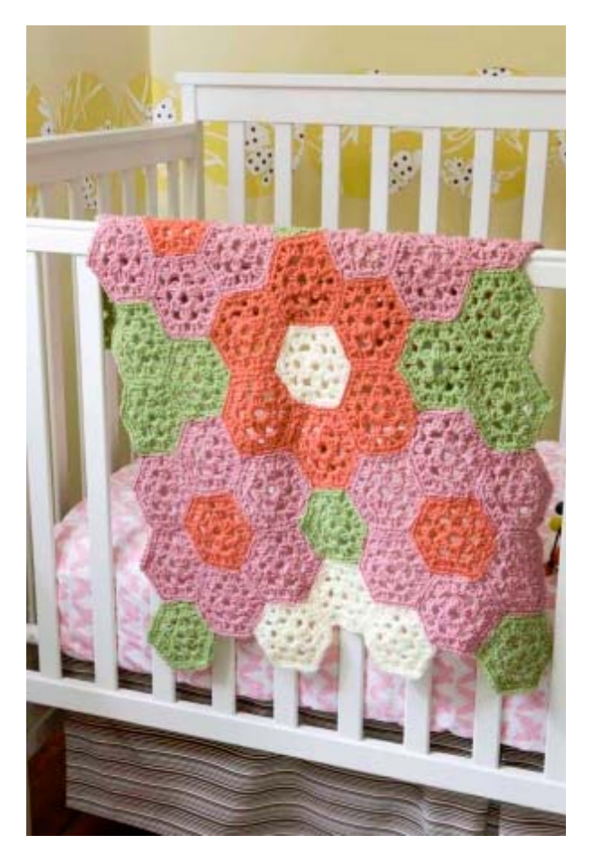
This flower throw is the perfect size for newborns and infants.