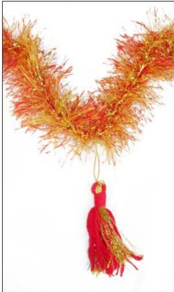
This cheerful decoration will brighten any Christmas tree