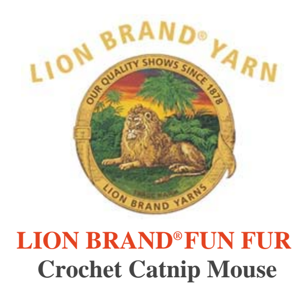
City Mouse, Country Mouse – a family of fun!