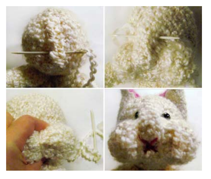
Cut a 2 yd (2 m) length of A and fold in half. Thread folded end into needle provided with loom. Insert needle into center of face and draw fold through.

Remove needle and draw yarn ends through loop and pull to tighten, anchoring the length of A.