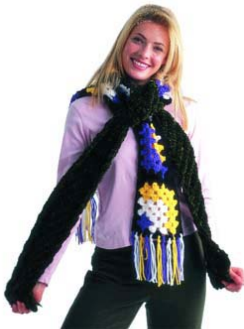
Shown: Chenille Thick & Quick Bias Scarf and Chunky★USA Granny Square Scarf