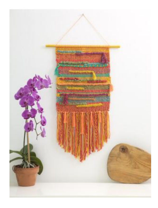
Designed by Bobbie Fitzgerald.

Free Loom-Woven Pattern Lion Brand® Modern Baby® Landscapes® Textures® Kitchen Cotton Homespun® Loom Woven Fiesta Wall Hanging Pattern Number: L50131