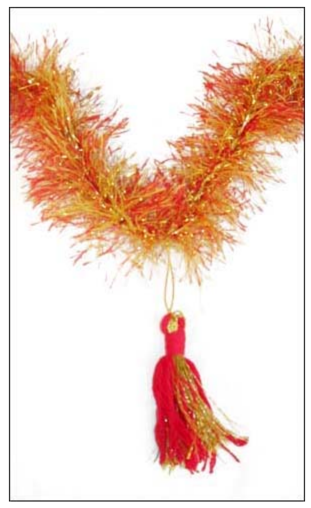
This cheerful decoration will brighten any Christmas tree