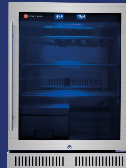
Steak Locker Home Edition