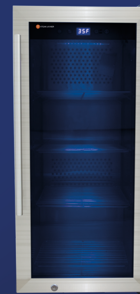
Steak Locker Studio

Warranty - 1 Year Full Warranty with optional lifetime warranty