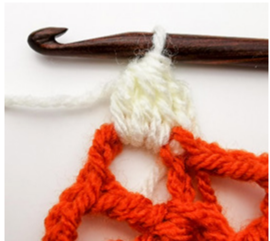
Photo 12: All 4 loops on hook pulled through. And first cluster (CL) finished