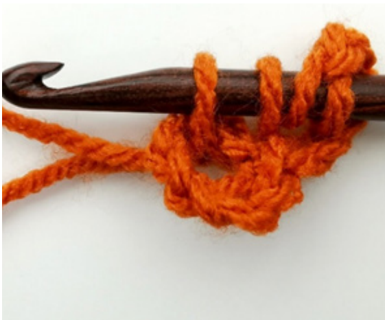
Photo 5: How it looks after you pulled up that first loop through the ring