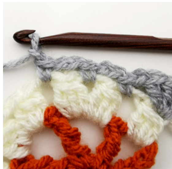
Photo 35: Ch 1, sc in next ch-2 sp, (ch 2, sc in next ch-2 sp) twice, ch 1.

For thousands of free patterns, visit our website www.LionBrand.com