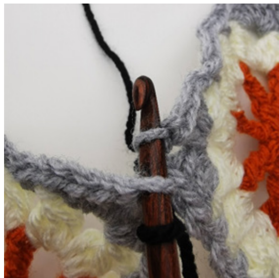
Insert hook in back loop of corner stitch on right square. Notice the working yarn is behind both squares.