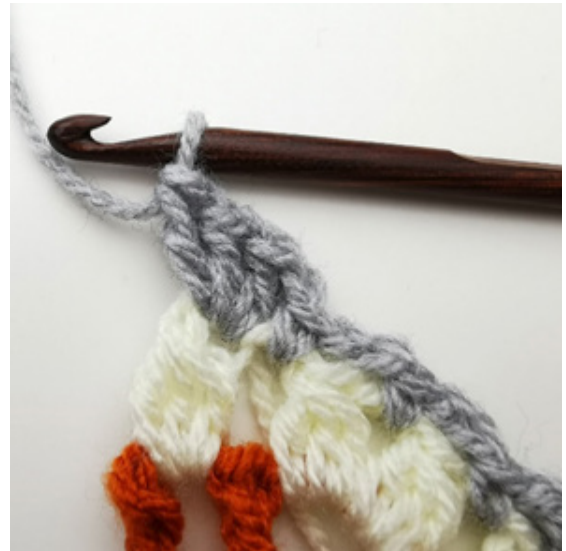
Photo 37: Ch 1, sc in next ch-2 sp, (ch 2, sc in next ch-2 sp) twice, ch 1, 3 dc in next CL.