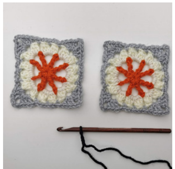
Make slip knot with D and place 2 squares like this.

Join the Squares and Half Squares using the flat slip stitch join as shown below and following the diagram for placement.