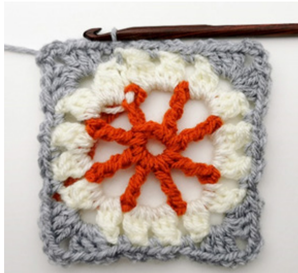
Photo 21: Previous steps repeated 3 times to finish the last round