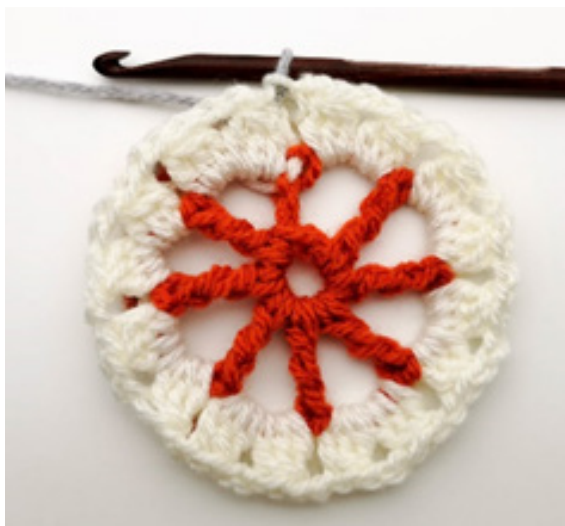
Photo 15: The prev steps with (CL, ch 2, CL) in next ch-3 sp, ch 2, repeated 7 times. Pulled through with C