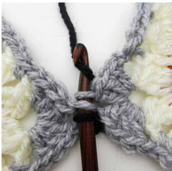
Hook inserted in next left stitch, then right stitch & yarn over

After finishing multiple sl sts & crossing over to the next 2 squares. Finish all squares in one row, then do rows in the same direction