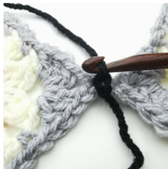
First sl st finished