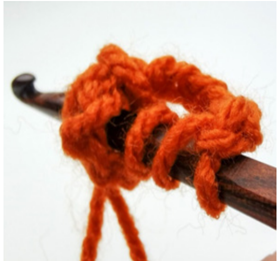
Photo 4: Tr in ring, showing how you go through the ring to draw up the first loop