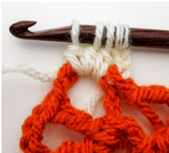
Photo 11: Repeated the previous steps 2 more times. You have 4 loops on hook