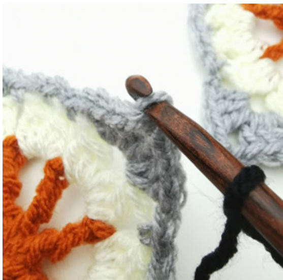
Insert hook in back loop of corner stitch on left square.