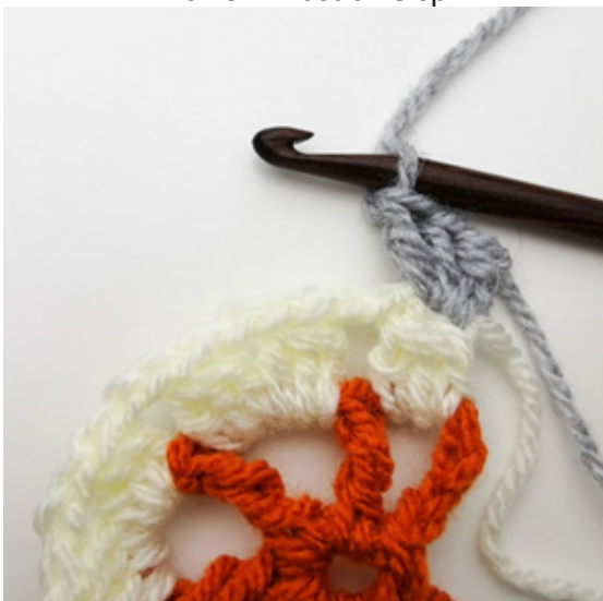
Photo 34: Always working on the right side. 3 dc in CL from prev row.