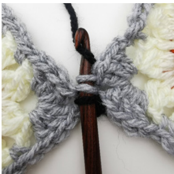
Yarn over, ready to draw through all 3 loops on hook.