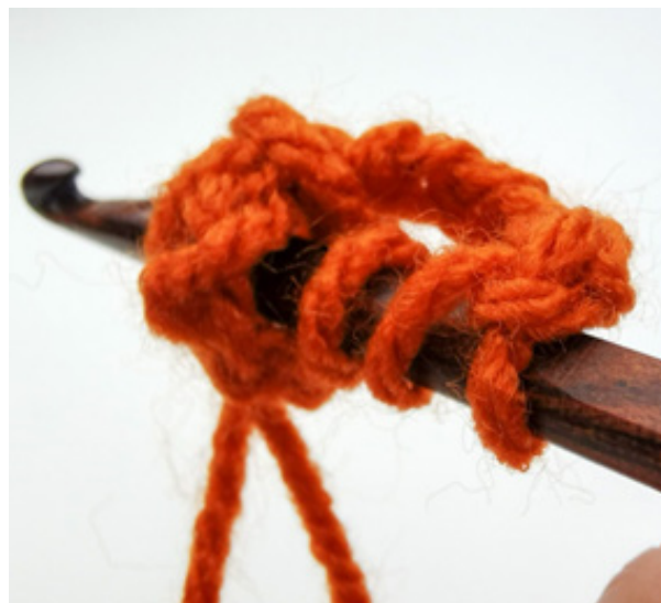
Photo 25: tr in ring, showing how you go through the ring to draw up the first loop