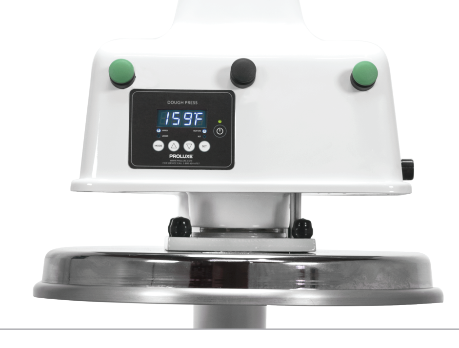
Impact X1M Electromechanical Automatic Dough Press with Mold Insert DP3300M

The Impact X1M brings automation to dough pressing for more compact spaces. Thanks to the bottom mold insert you'll have a perfect crust every time. It uses a single upper heated platen to help your dough relax, press, and hold it's shape.