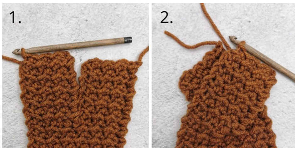
Showing the steps of the twist. Photo 1: Work across part 2. Photo 2: Cross part 2 over part 1.