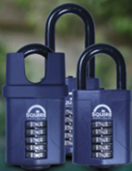
CP60 Range 60mm - 5 Wheel