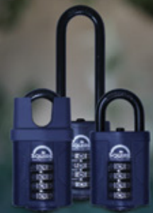
CP40 Range 40mm - 4 Wheel