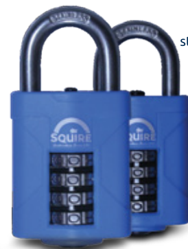
CP50S and CP40S - 50mm and 40mm padlocks 4 wheels 10,000 combinations Rustproof - Stainless steel shackles