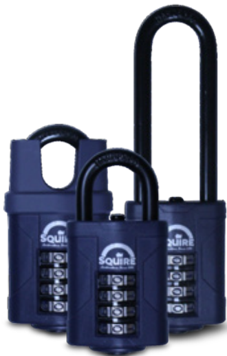
CP40 - 40mm padlock 4 wheels 10,000 combinations