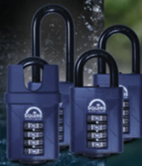
CP50 Range 50mm - 4 Wheel