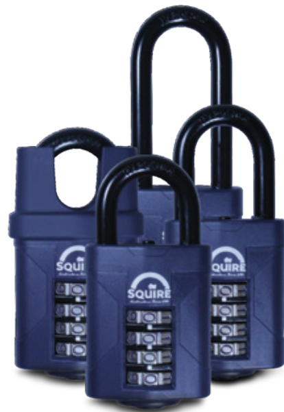
CP50 - 50mm padlock 4 wheels 10,000 combinations