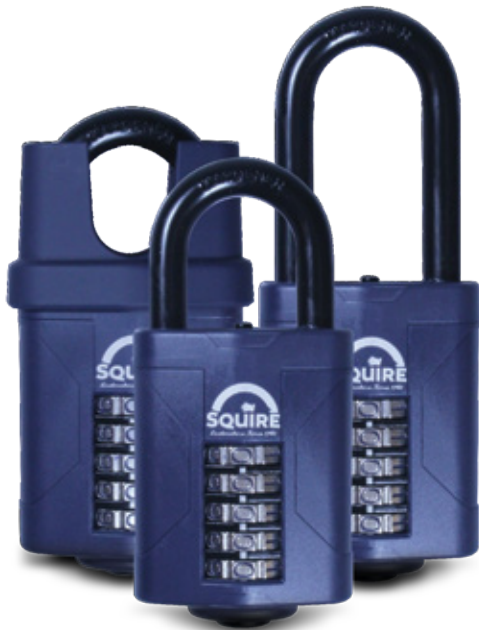
CP60 - 60mm padlock 5 wheels 100,000 combinations