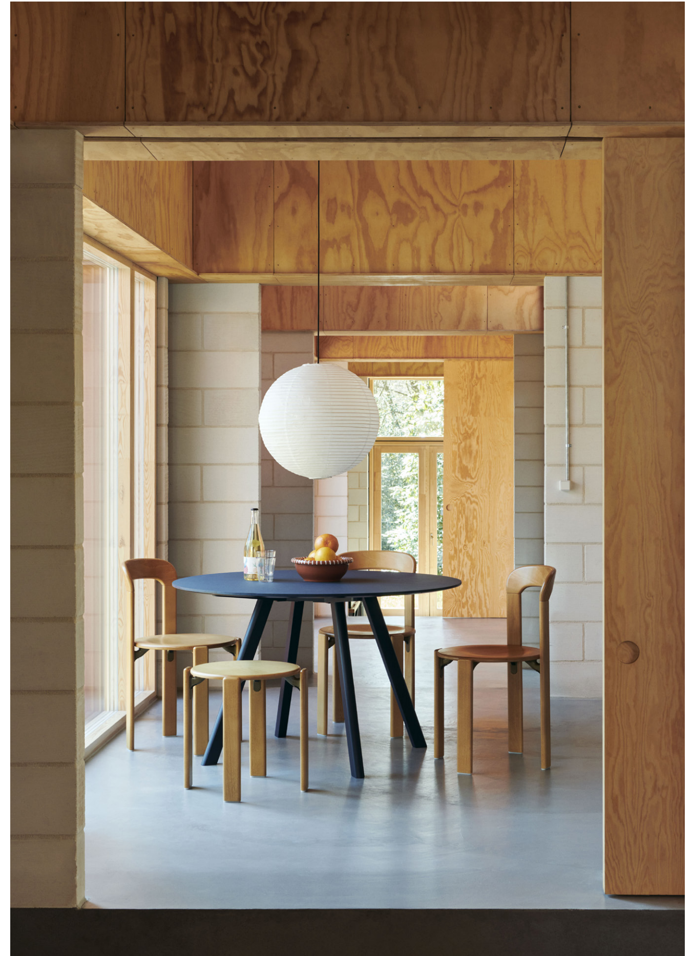
CPH 25 Table Ø120 | Smokey blue linoleum tabletop | Deep blue oak frame

Sharing the same characteristic angled legs as the rest of the Bouroullec brothers' Copenhagen range, the CPH25 table features a round tabletop that softens the engineered expression. The four-legged table frames and tabletops are available in a variety of wood types, materials, and colours, with the possibility to select matching or contrasting combinations. Equally suitable for intimate meetings and larger, café-like environments, this versatile table has an ability to blend into private homes as well as public spaces.