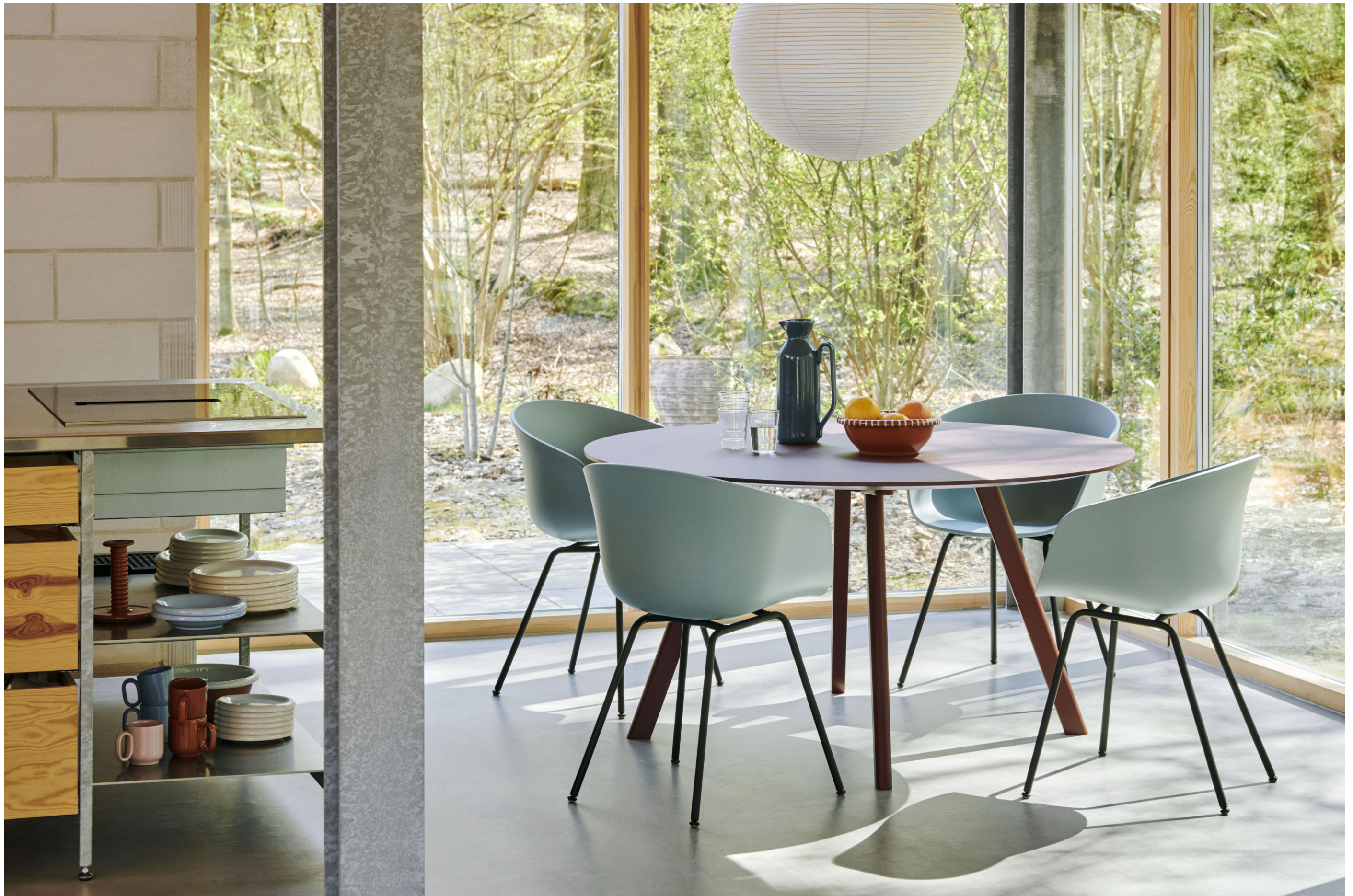
CPH 25 Table Ø140 | Burgundy linoluem tabletop | Bordeaux oak frame