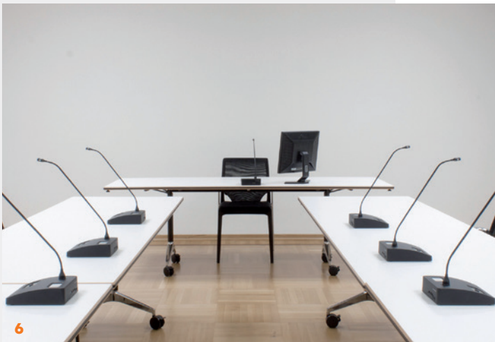
Flexible, wireless product family for 1 conferences 6 meetings 5 podiums 2 presentations and 3 video conferences – 4 quickly and easily set up and dismantled.