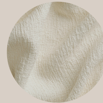
Plaster LIM 1