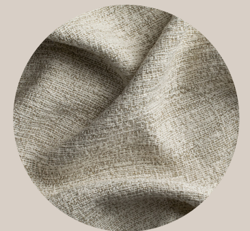
Pumice LIM 3