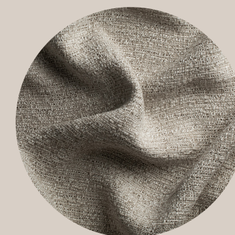
Shale LIM 4