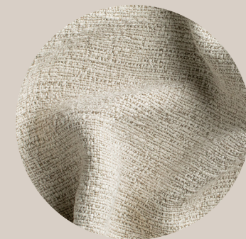
Marble LIM 2